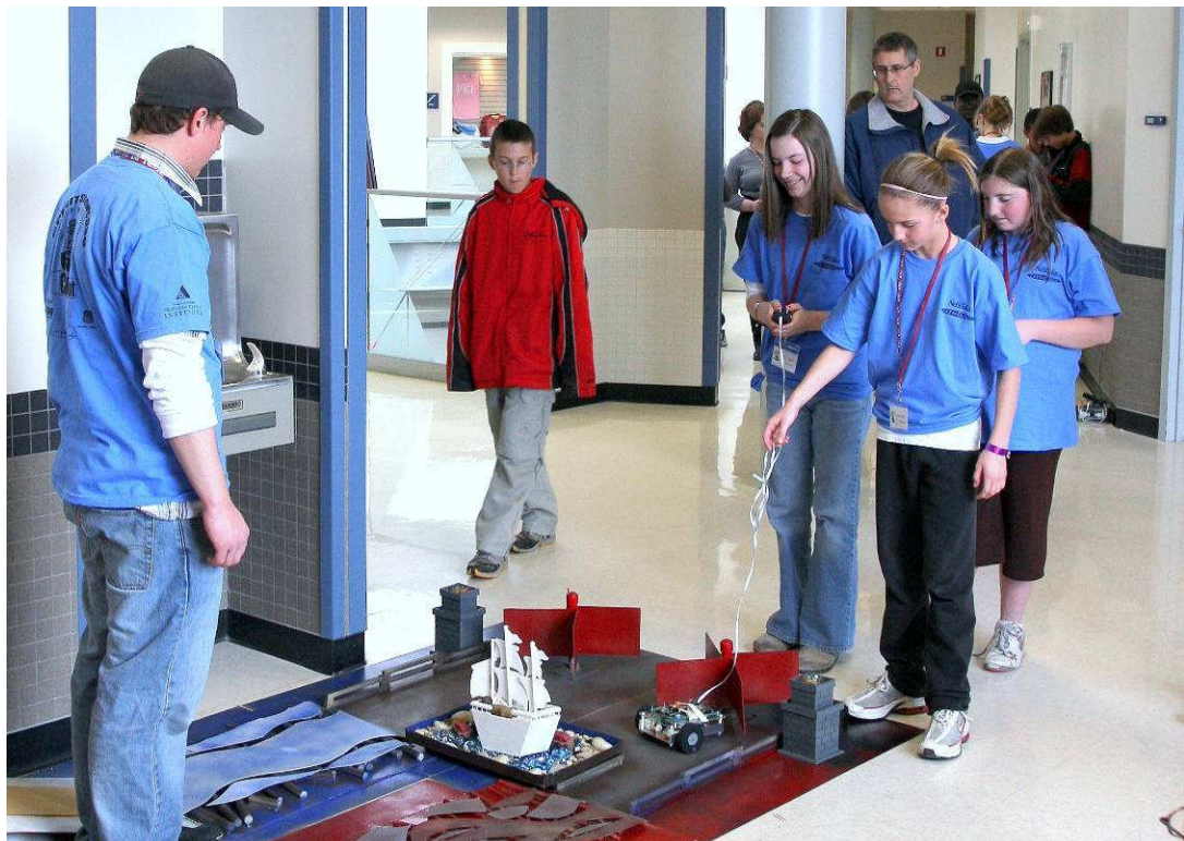
The Tera Heights all-girls TekBot® team navigates the road-obstacle course.