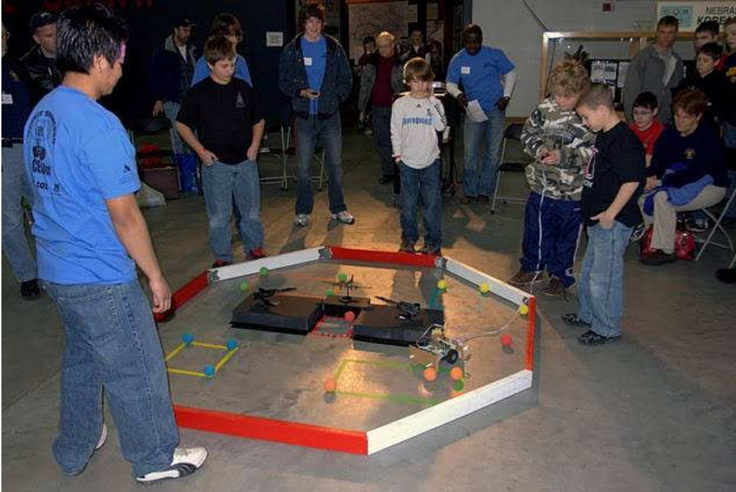
Student team drives their TekBot® through the Ball Arena.