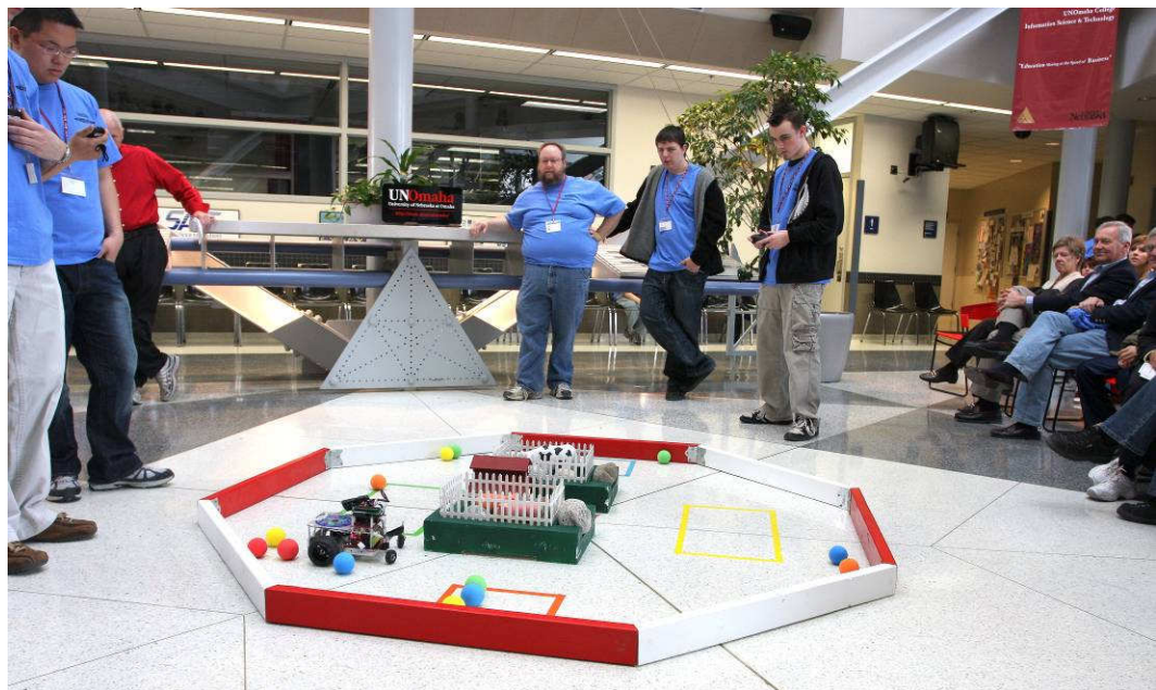
The Benson High School CEENBot™ team pilots the ball maze wirelessly.