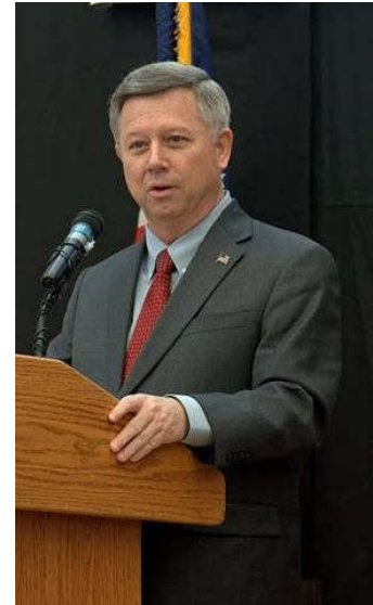
Nebraska Governor Dave Heineman gives the opening talk