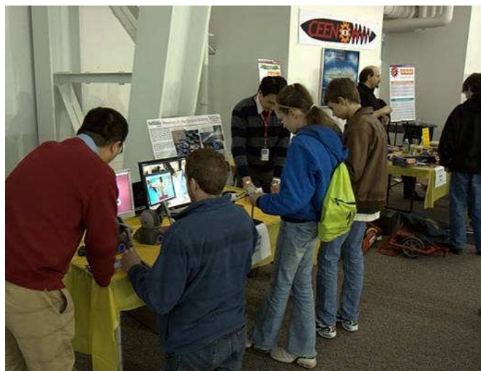
UNMC Surgical Robotics Demonstration fascinates students