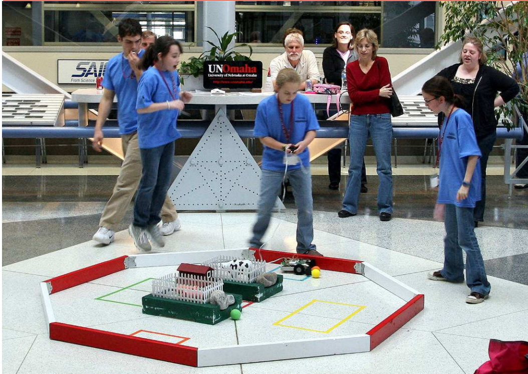
An all-girls middle-school TekBot® team pushes to score in the final seconds.