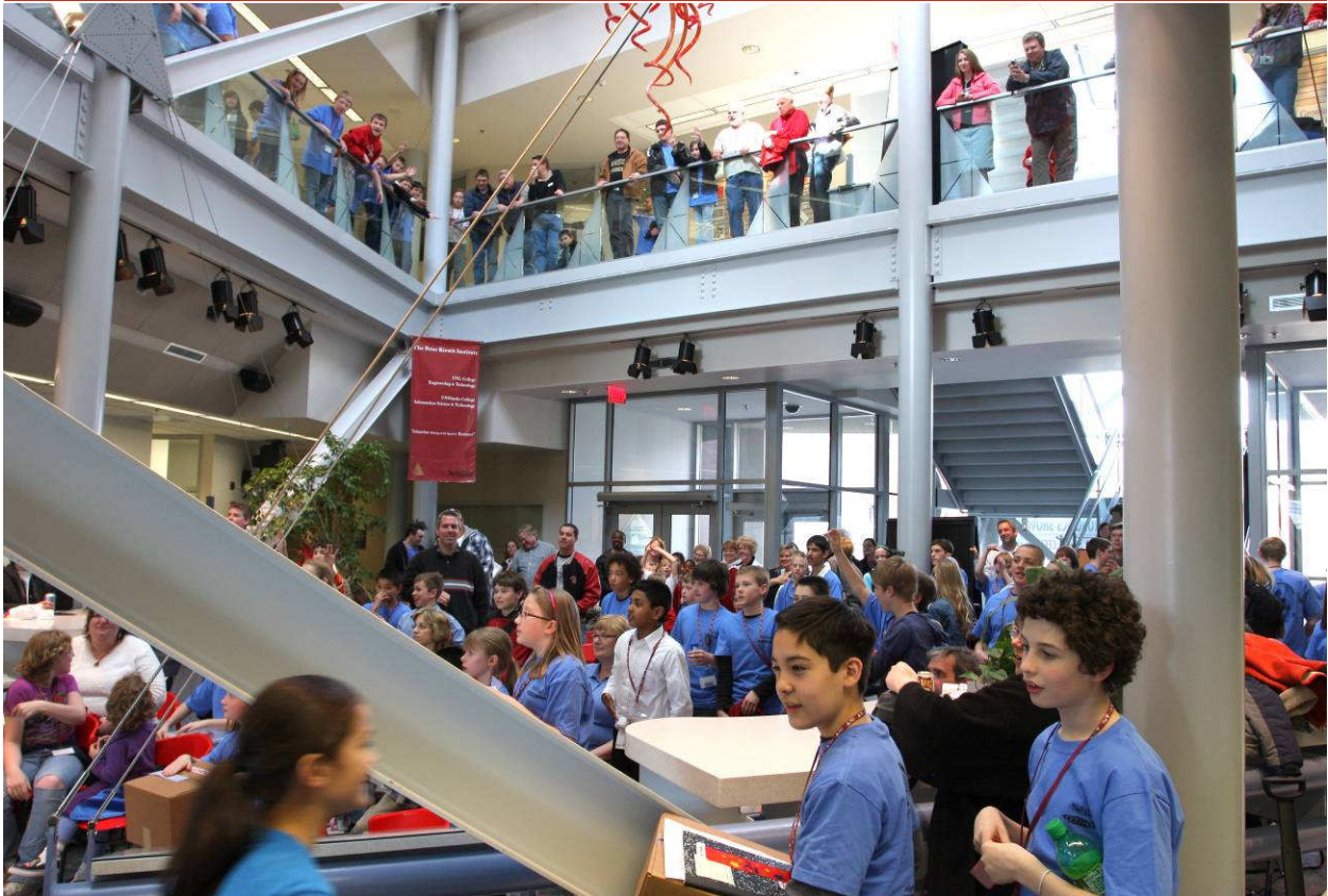
Many middle/high school students, teachers, and parents attended this Saturday event.